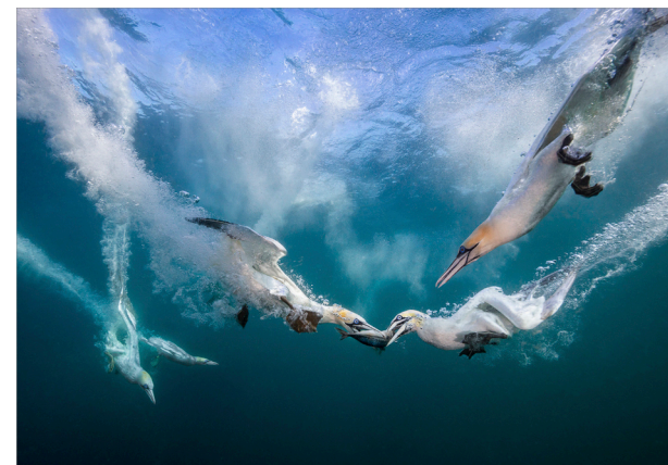
Diving Gannets 2, Shetlands