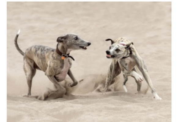
Keep off my Beach by Bill Hall, Rolls Royce PS