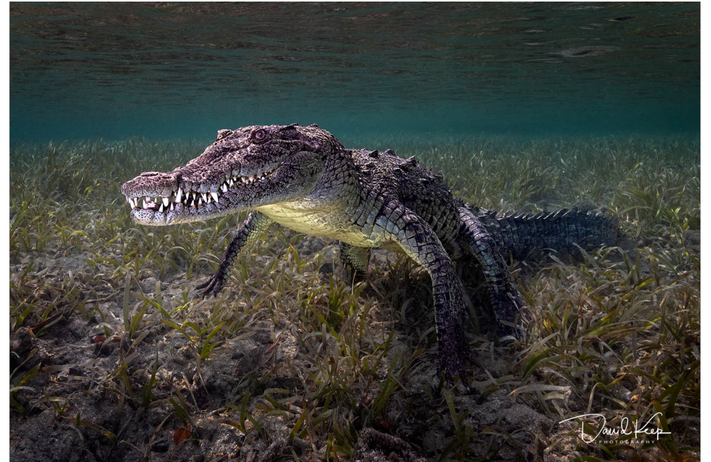
Saltwater Crocodile, Mangroves of Cuba

Thankfully it was worth the wait and I was delighted to be informed that my application had been successful.