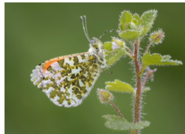
Orange Tip Early Morning by Neil Humphries, Rolls Royce PS