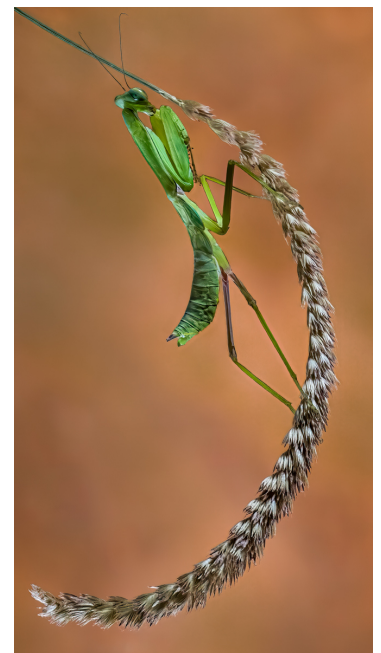
Praying Mantis on ear of wheat

At club competitions I soon realised how fragile my photographic ego was! But the club has given me the encouragement and confidence to finally achieve my CPAGB, helped recently by a panel of N&EMPF judges' assessment of my images. This, plus insights gained from entering FIAP salons, has helped my awareness of what is a 'good photo'. For competitions, I continue to dip into my bank of photos held on computer and regularly choose images to process that I have previously rejected.