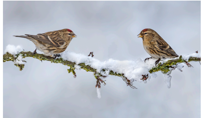
Lesser Redpoll Pair in Winter