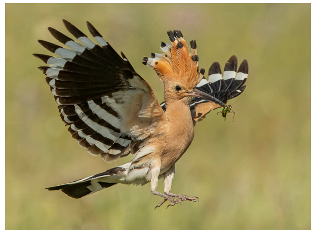
Hoopoe Landing