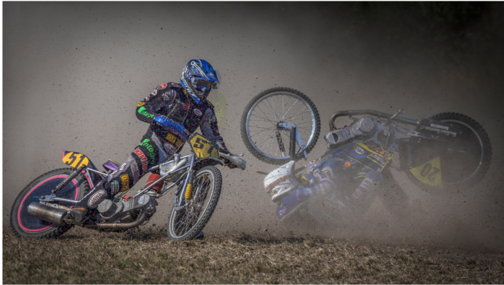
Mayhem in the Dust