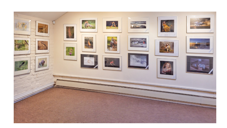
Some of the galleries in the Exhibition