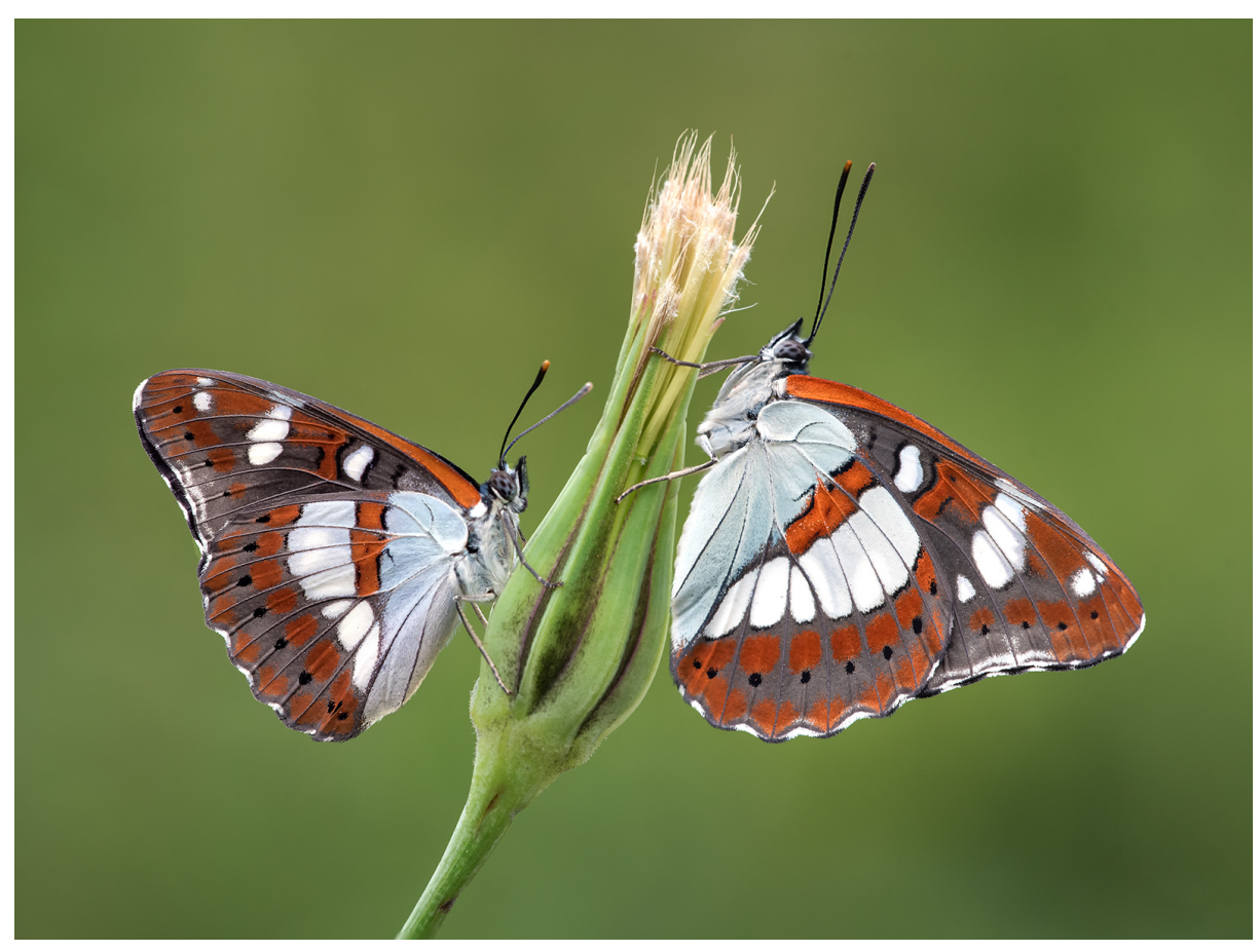
White Admiral on Goat's Beard Winner of best Nature PDI