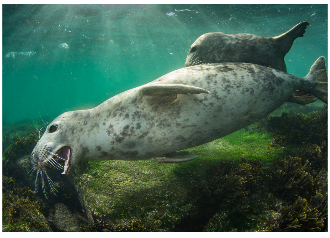
Grey Seal Courtship by Rob Cuss of Rolls-Royce (Derby) PS Selectors choice of Jane Lines - Nature Print