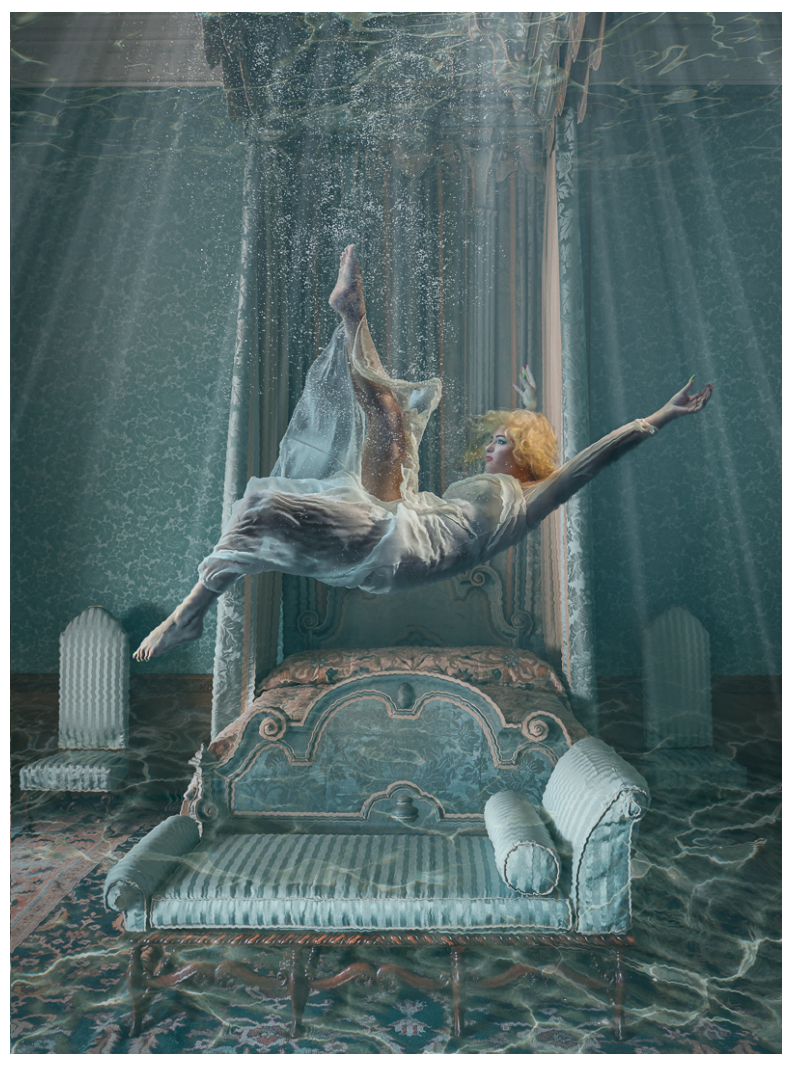
Dream Fall by Lester Woodward of Nottingham Outlaws PS Selectors choice of Adrian Lines - Colour Print